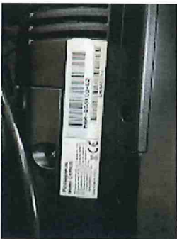
old pos 3.jpg 133K