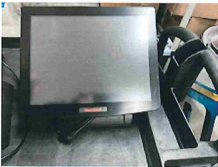
old pos.jpg 122K