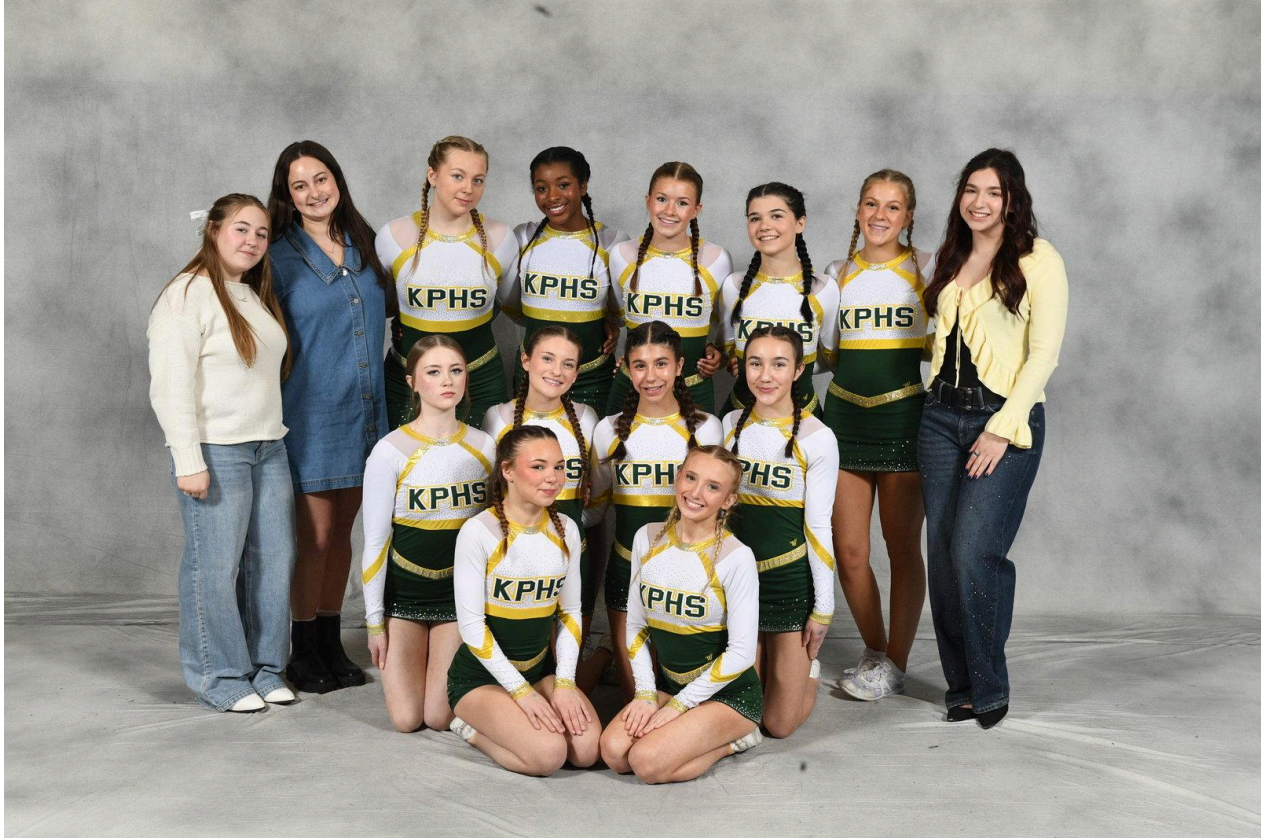
Varsity Cheerleading Team at States