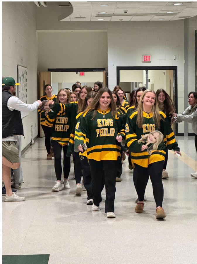
The King Philip Regional Girls Hockey Team being cheered walking the KPHS hallways on March 13th