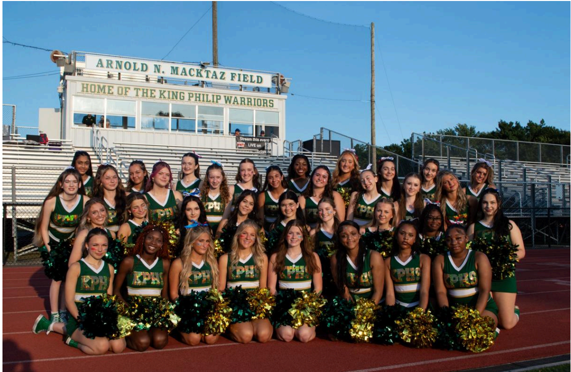
Fall Cheerleading Team