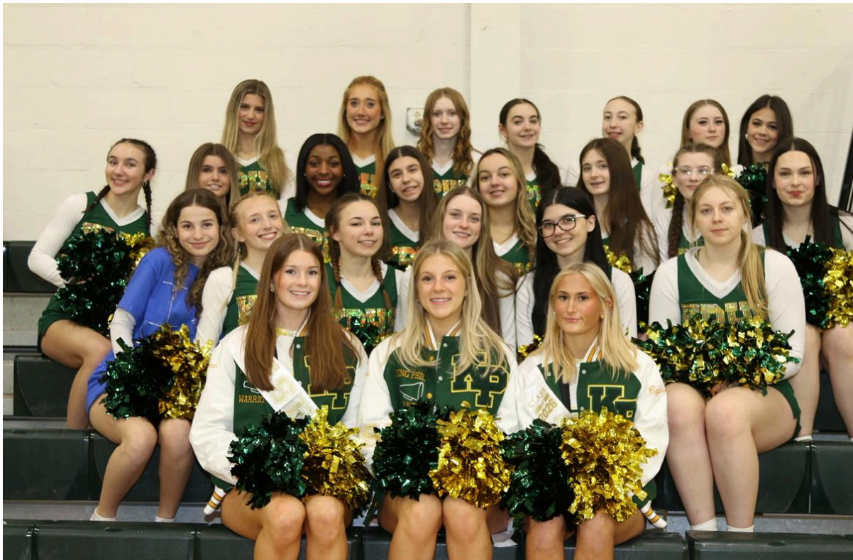
Winter Cheerleading Team