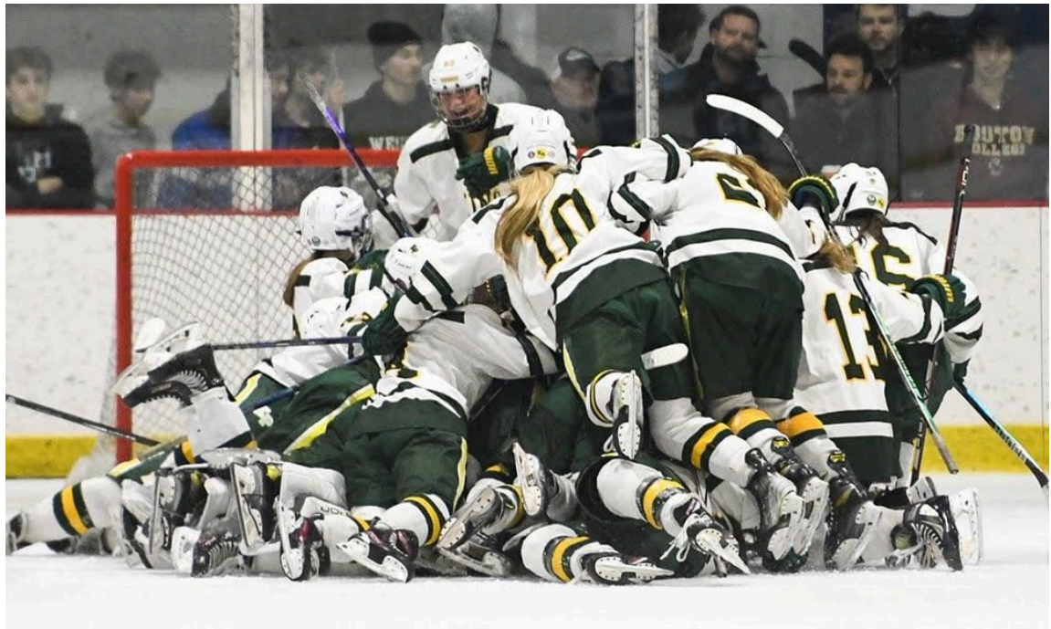
The King Philip Regional Girls Hockey Team celebrating a 2-0 Final Four semifinal victory of Medfield.